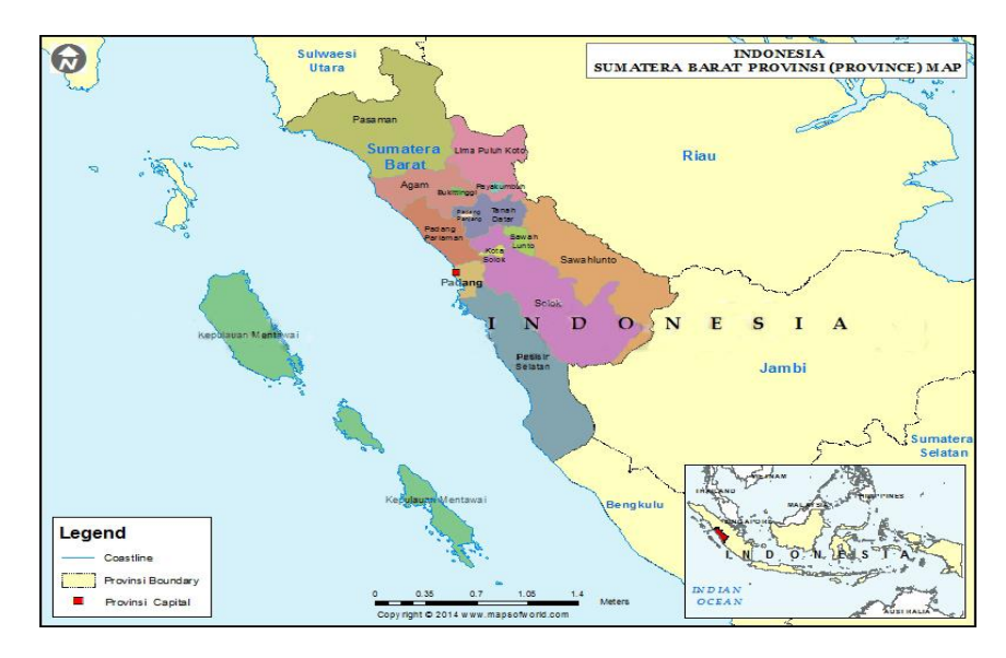
Picture 1: Map of the districts of assigned cocoa center production areas in West Sumatra, Indonesia.

Survey for investigation of fruit with disease symptoms were conducted on 36 cocoa plantations in the districts of Tanah Datar, Payakumbuh, Lima Puluh Kota, Padang Pariaman, Pasaman and Sijunjung, which are under the administration provincial system of the Province of West Sumatra (Picture 1). All of the districts are assigned as cocoa production center regions in West Sumatra. Lack of good agricultural practices implemented in the regions were found in 32 out of 36 plantations of the six districts surveyed. During the survey, there was no plantation free from fruit diseased with the percentage was relatively similar up to 45% at each of the plantation surveyed. The plantation of PT Inang Sari was then chosen for this project because it represents the situation of cocoa's plantation in all of these six districts, with none of the blocks free from disease attack. The symptoms on severed fruit, both symptoms of pests and diseases were present in each block, ranging between 20 to 45%. The disease attack can be easily recognized visually. PT. Inang Sari cocoa plantations was opened in the 1980s and have been gradually developing. Today, the plantation covers a vast \pm 400 ha. Since 2006, there has been an increase in plant disease attacks in this plantation. Control is mainly conducted using chemical pesticides, however it has been proven that the attacks are beyond control.